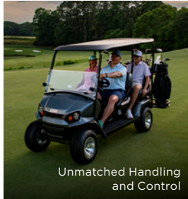
Unmatched Handling and Control