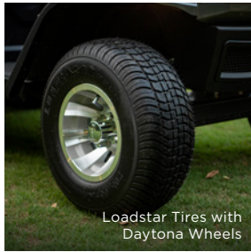
Loadstar Tires with Daytona Wheels