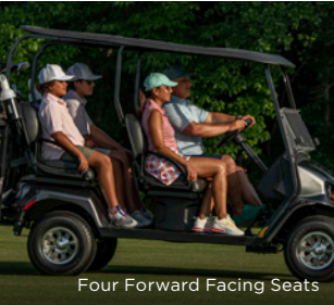
Four Forward Facing Seats